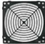
Plastic Finger Guards