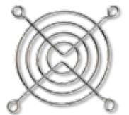
Metal Finger Guards - Chrome & Powder Coated